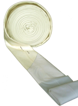
Liner with "Open-end"