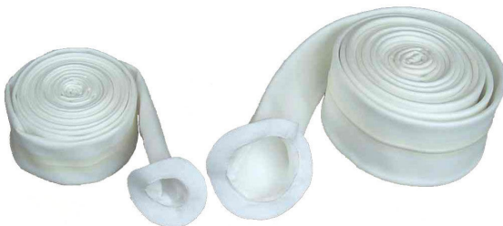
T/Y -Brimmed liner