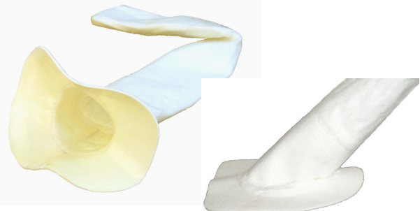
Close up of the brim