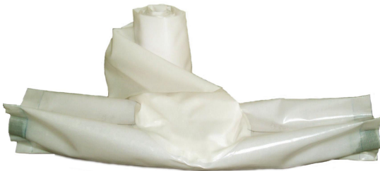
T/Y-Calibration for Brimmed liner >100mm