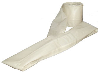
T/Y-Calibration for Brimmed liner <100mm